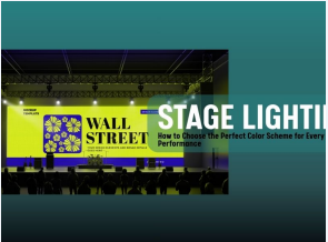
Stage Lighting: How to Choose the Perfect Color Scheme for Every Performance