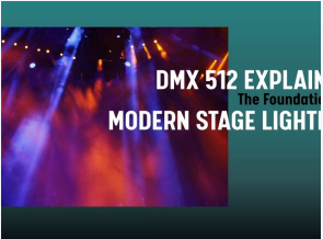
DMX 512 Explained — The Foundation of Modern Stage Lighting