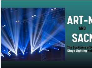
What are Art-Net and sACN? The Backbone of Modern Stage Lighting Networks