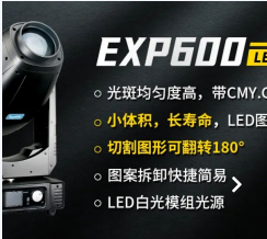
Starting from Real User Needs: XML Develops a Series of LED Profile Moving Heads to Reduce Costs While Meeting Specific Application